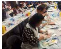
Skin Cancer CPD Workshop run for IPN and ASCC